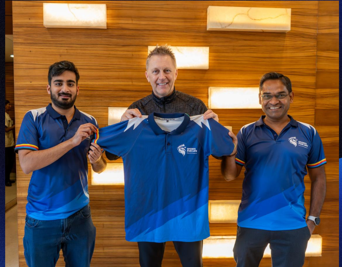
Heimir Hallgrímsson- SFL Football Mentor and Global Ambassador